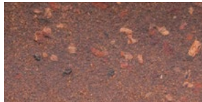
KAKAU** COCOA HUSKS