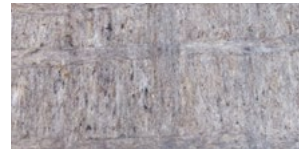
WOLLÄ WOOL FROM THE TYROLEAN MOUNTAIN SHEEP