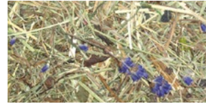
WILDSPITZE LAWENDL* ALPINE HAY WITH LAVENDER