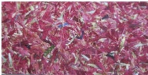
KORNBLUAMA ROAT* CORNFLOWER BLOSSOMS RED