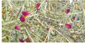
WILDSPITZE ROASA* ALPINE HAY WITH ROSE PETALS