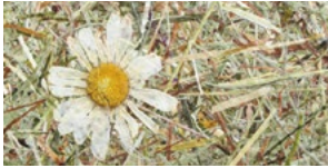
WILDSPITZE MARGERITTA* ALPINE HAY WITH MARGUERITES