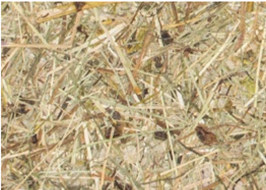
WILDSPITZE* ALPINE HAY

*slightly fragrant / other surfaces on request